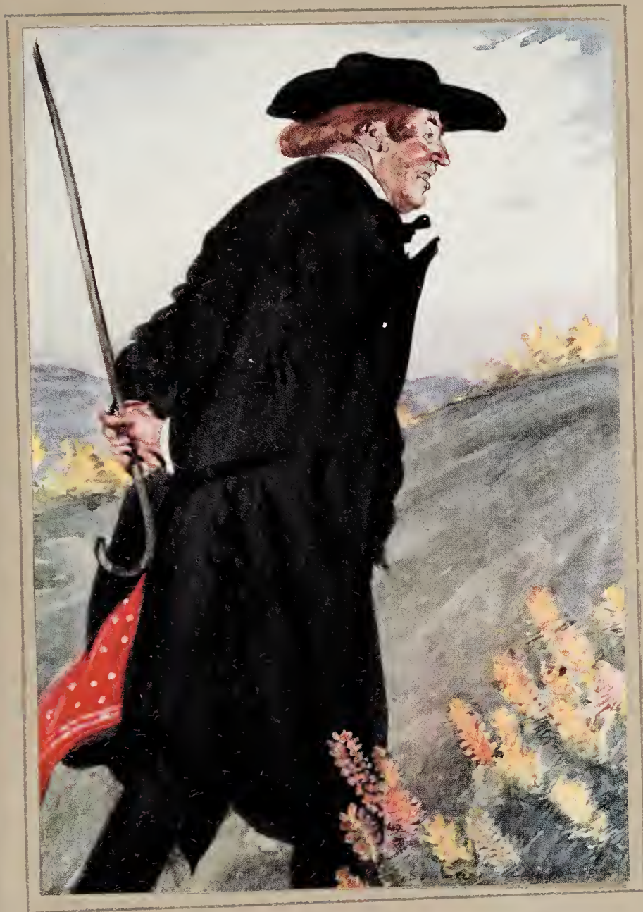
"THE MAN IN BLACK."